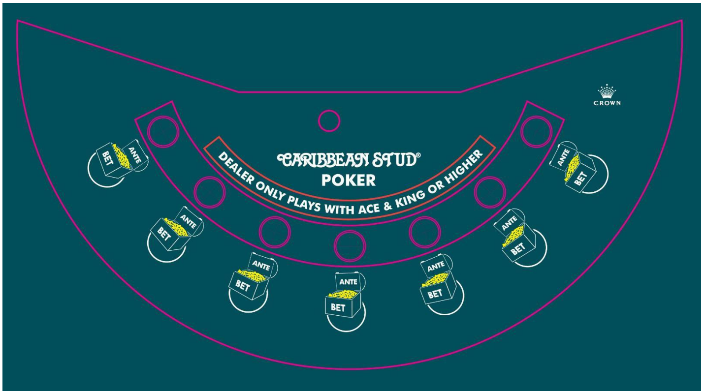
DIAGRAM A- CARIBBEAN STUD POKER

*Note – purple double-ringed circles in front of the Ante betting area are indicative of where Jackpot Wagers will be placed.